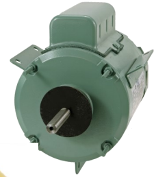
"T" 3 Bracket + Ext. thru-bolts