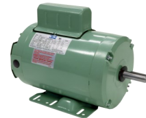
"B" = Rigid base F537 *T540A, *T539A *= No Capacitor