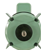
"Q" = 4-Bracket + Extended thru-bolts F838 *T840, T839 *T840A, T839A *= No Capacitor