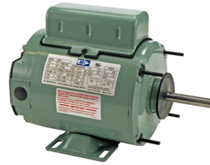
"M" Base + Ext. thru-bolts