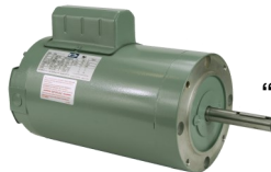
"C" = C-flange F644