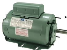
"K" = Resilient base + Extended thru-bolts F836