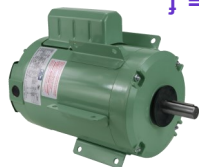
"L" = 6 Bracket F648