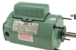
"E" = Extended thru-bolts F835, F984 F985, F986 *T606, *T635 *= no capacitor